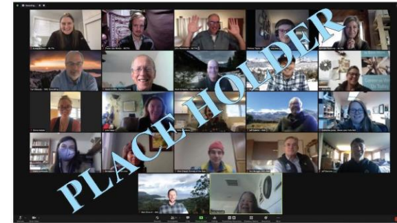
The Visitor Connection Working Group, February 2021

The Sustainable Recreation and Tourism Initiative is grateful for the contributions and participation of the following: