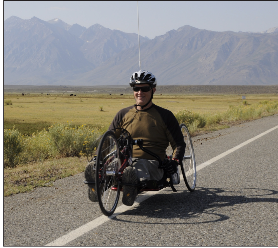
This hearty soul pedaled the short route by using his arms, back, and other muscles on the Fall Century Ride on Sept. 10.